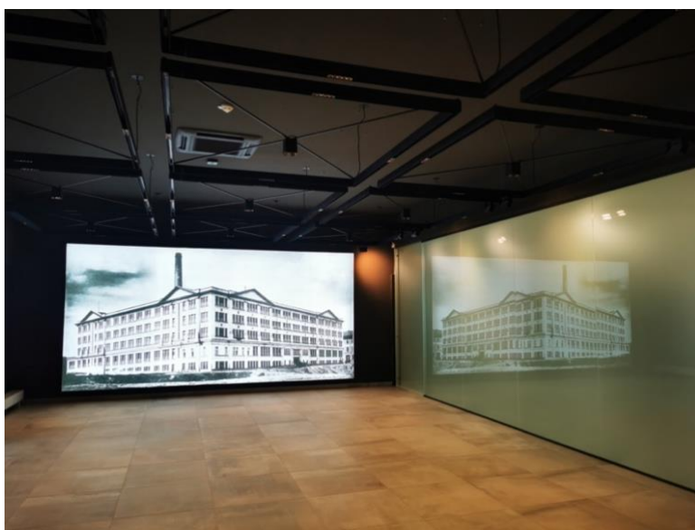
The lobby of the Informatics building, which shows its past as a textile factory. The city of Brno was historically an important center of textile production.