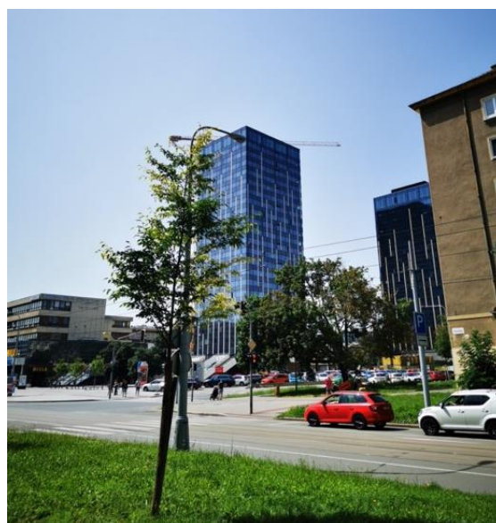
New home of the EOOSC CZ Initiative